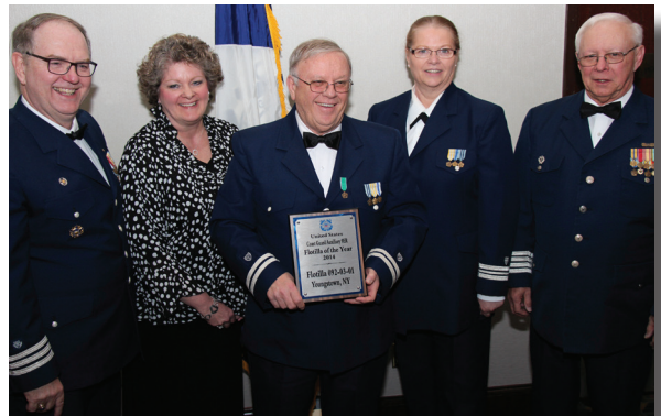
Flotilla of the Year: Youngstown Flotilla 3-1