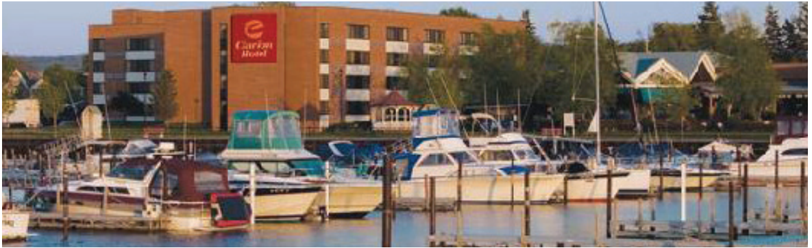
The Clarion Hotel Marina in Dunkirk, NY.