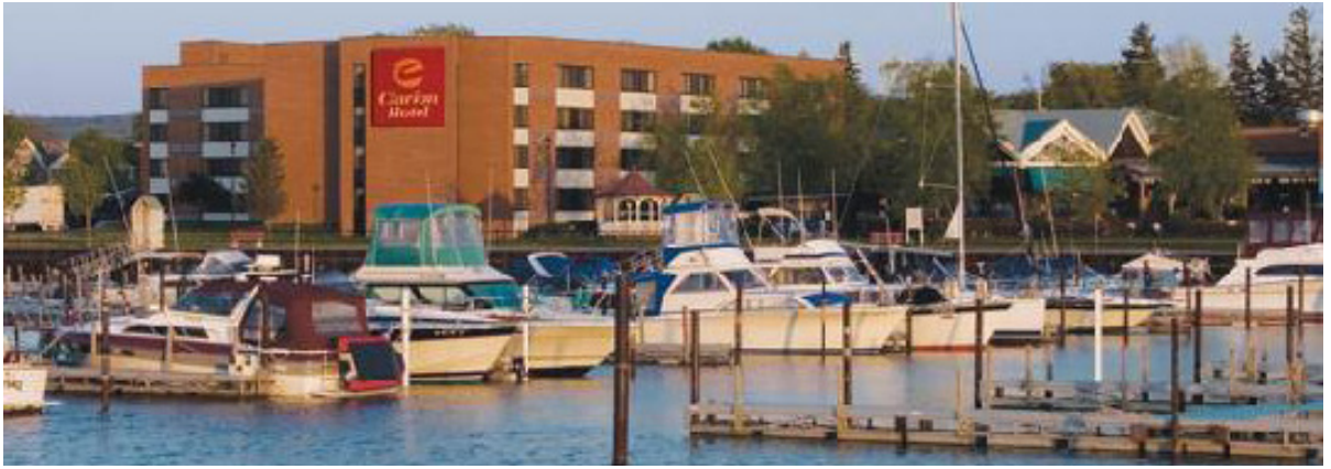
The Clarion Hotel Marina in Dunkirk, NY.