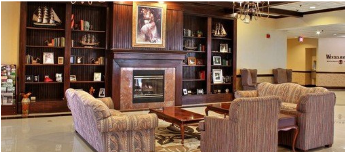
Lobby of the Clarion Hotel Marina and Conference Center.

patriotic themes honoring our country and the military.